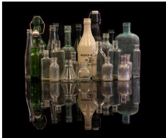
Old Bottle Reflections by Jim Lewis